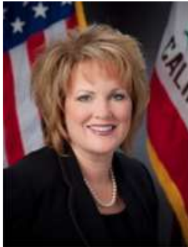
Senator Shannon Grove State Senate Minority Leader CA 16th Senate District