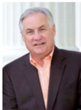
Assemblyman Jim Patterson CA 23rd Assembly District