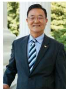
Assemblyman Steven Choi CA 68th Assembly District