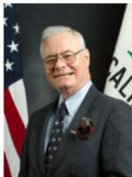
Assemblyman Randy Voepel CA 71st Assembly District