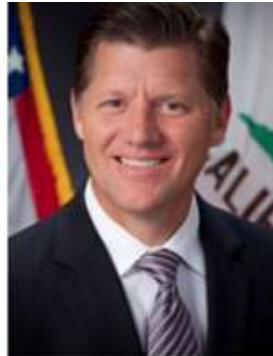
Senator Brian Jones CA 38th Senate District