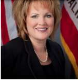
Senator Shannon Grove State Senate Minority Leader CA 16th Senate District