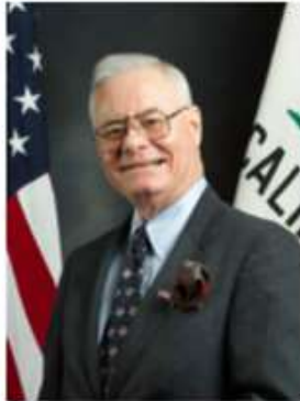
Assemblyman Randy Voepel CA 71st Assembly District