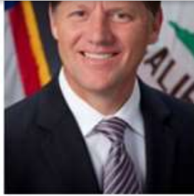
Senator Brian Jones CA 38th Senate District